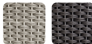
Round Searope Pearl